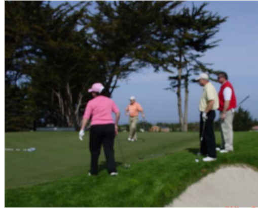
Participants in the Monterey District Golf Tournament line up a putt.