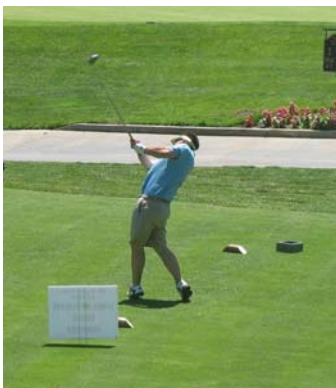
A golfer in action at the 2008 Bay Region Golf Tournament.

GOLF SEASON IN FULL SWING: Register today for the Bay Area Region Golf Classic which is to be at the Castlewood Country Club in Pleasanton on Monday, June 22 . Tournament features include a barbecue luncheon, a round of golf, seated dinner, tee prizes, competition holes, a raffle drawing and more! Early registration rates end Fri., June 5 so sign up today! Castlewood is a members-only golf course which makes this event an exclusive opportunity to play on one of the Bay Area's finest courses while networking with other AGC members and guests from the entire Bay Area Region. This is sure to be a great event and will fill up fast, so sign up early! To register, visit the AGC website and follow the link to the registration form. For more information, please contact Kristen Fracisco at (925) 827-2422.