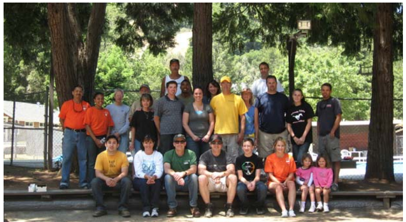
The group of volunteers at Camp Costanoan.