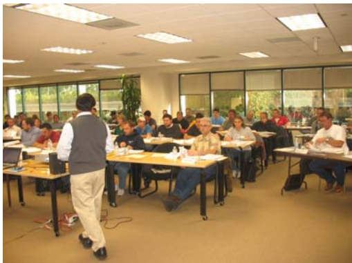
A full class listens to the instructor.

RECEIVE THE TRAINING YOU NEED: Sign up today for important education and safety training courses now being offered by AGC of California. Upcoming classes in March include March 11 – BIM 101 ; March 19 – Construction Insurance and Bonding; March 25 – LEED Green Associate Training ; March 26 – LEED AP Building Design and Construction Training ; March 29 – Bidding Public Works Seminar. All training classes will be held in Concord, CA at 1390 Willow Pass Road, Suite 480 (fourth floor). For more information or to register, please contact Ryan Famularo at (925) 827-2422.